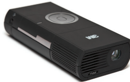
3M MP160 HK400000665