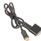
ADAPTER CABLE FOR APPLE® [optional] 78-6972-0034-9