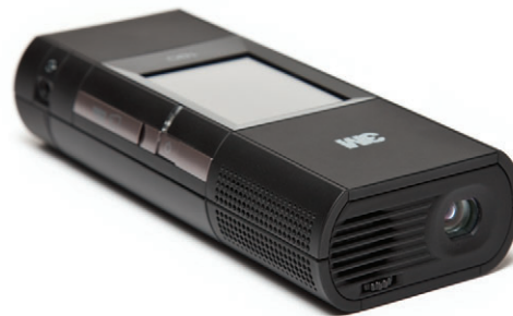
3M MP180 HK400000673