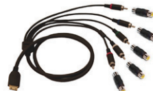
COMPONENT AV CABLE [optional] 78-6972-0032-3