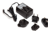
POWER ADAPTER with INDIA, US, UK, AUS plugs 78-6972-0033-1

In the Box: Projector, Battery, Wall Charger, Charger Adapters (US, EU, UK, AUS), USB & Computer Cables, Composite Video Cable (RCA), Tripod, Soft Protective Pouch, Quick Start Card