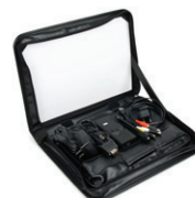
REMOTE [optional] 78-6972-0035-6